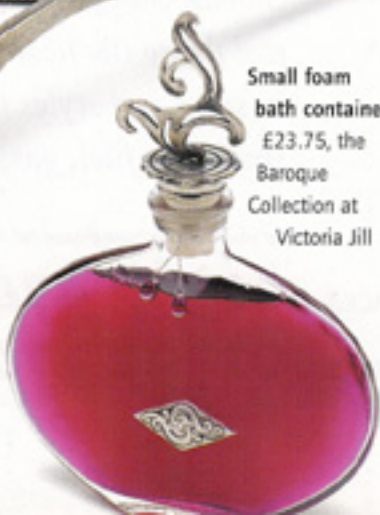
Small foam bath container, £23.75, the Baroque Collection at Victoria Jill