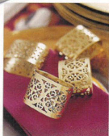
Byzantine napkin rings, £10 for four, Past Times