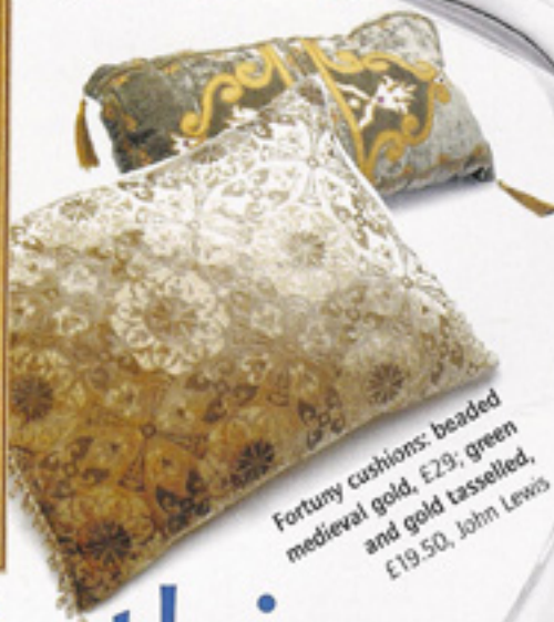
Fortuny cushions: beaded medieval gold, £29; green and gold tasselled, £19.50, John Lewis