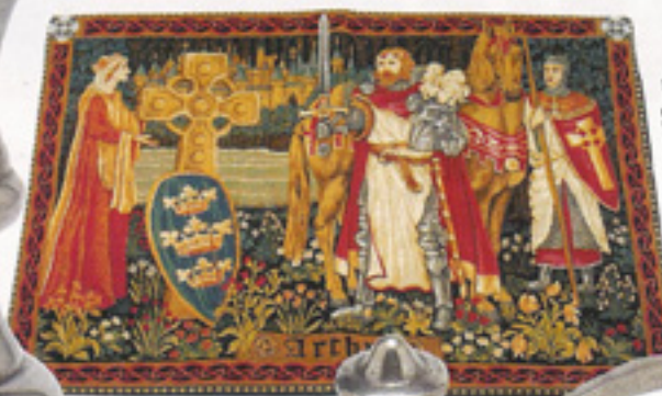
Arthur tapestry, 48 x 62cm, £75, Flemish Tapestries

Make an impression with dramatic gifts in Gothic and medieval styles